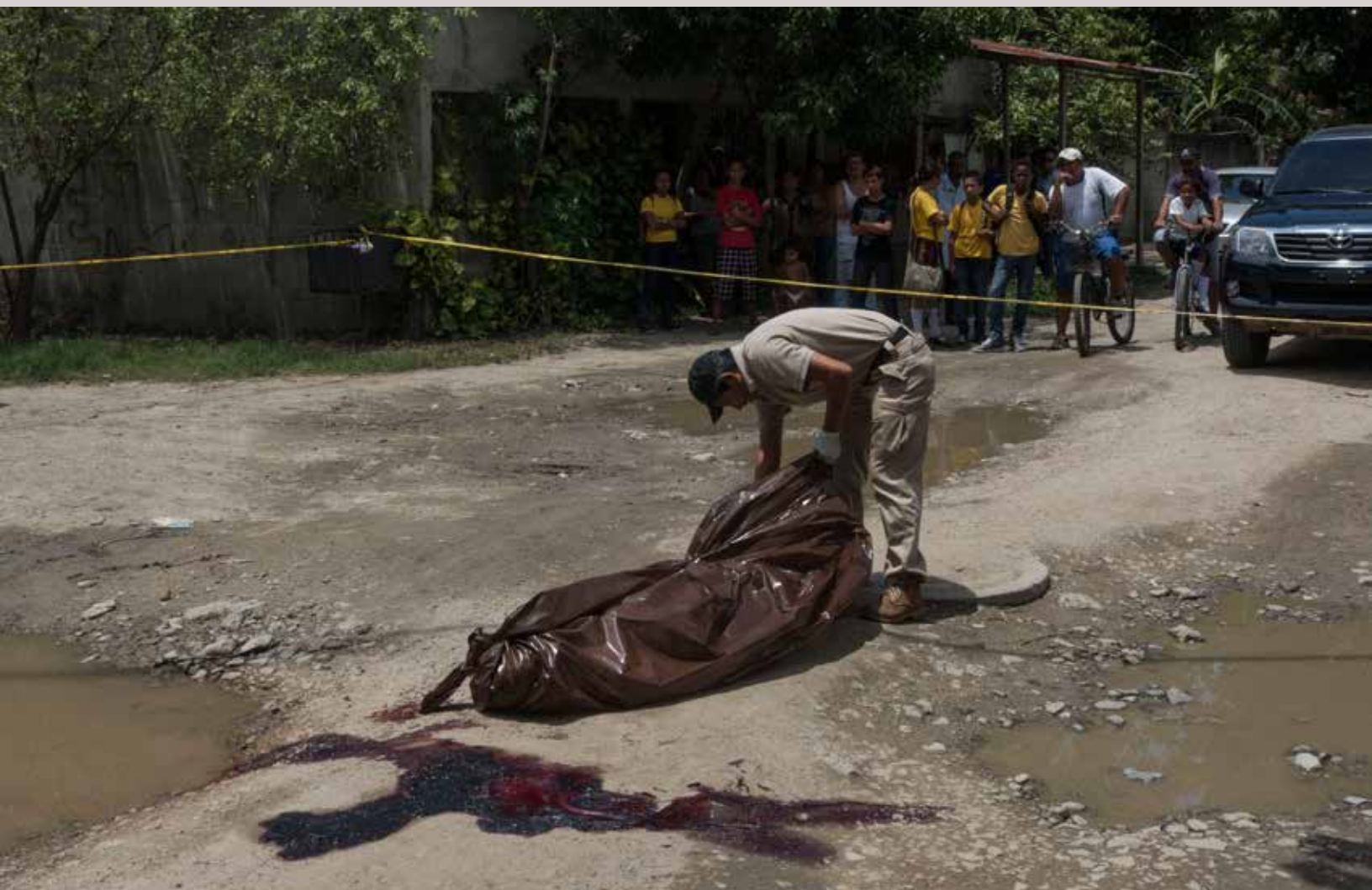
Murder victim in the central neighborhood of the Rivera Hernandez district of San Pedro Sula, Honduras, September 8, 2014.

The vast majority of migrants crossing the US-Mexico border without authorization are placed in detention and undergo a hasty two-part assessment by US officials under either “expedited removal,” for first-time border crossers, or “reinstatement of removal,” for migrants who have previously been deported from the United States.