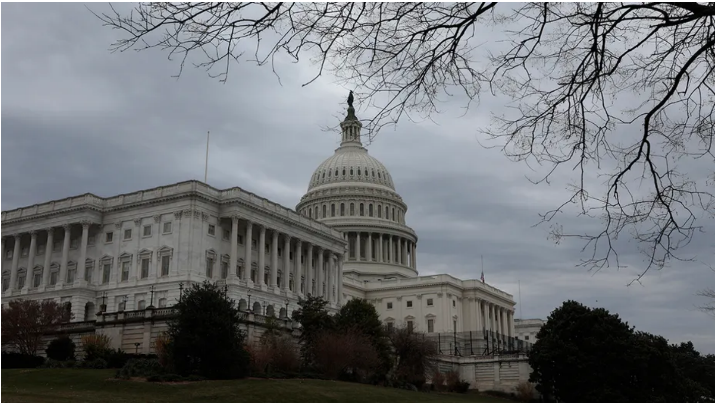
The House could vote on the EAGLE Act as early as Wednesday.

Immigration hawks have opposed the legislation, arguing that it would lead to a dominance of the immigration system by immigrants from China and India at the expense of other countries.